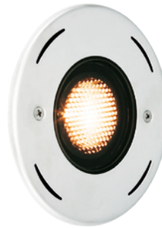
LS333ANS-2 Pool Luminaire