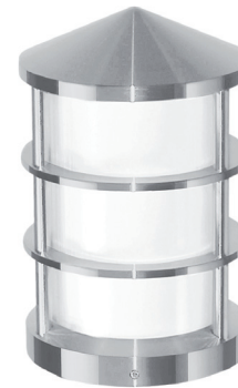
LS582 Balitza Mini

Any luminaire can become hot - take care with appropriate use and placement